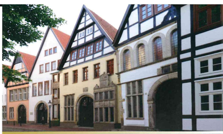
Minden Museum, Ritterstraße

For those wishing to discover Minden's history and the "Glacis" Park along the River Weser, we recommend the Old-Town-Route (red marked) and the Weser-Path (green marked). Experience the Old-Town-Route on the Minden Beacon Mile.